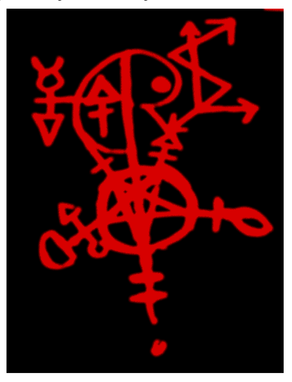
Complete Sigil of "THE DOOMBRINGER" - 663

The temples of The Doombringer are tended by those priests of the Domus Kaotica, the House of Khaos. They are the keepers of the emanations, the children of The Doombringer. The system of emanations was created from the Hesiod's Pre-Olympian Pantheon with the origin as Chaos. I think that using specific manifestations of the Doombringer I could get more exact results when working with more specific attributes so I coupled each manifestation with a primary emotion (according to Plutchiks chart of Primary Emotions). This system was created with the sole purpose of opening up a sea of possibility when working with The Doombringer.